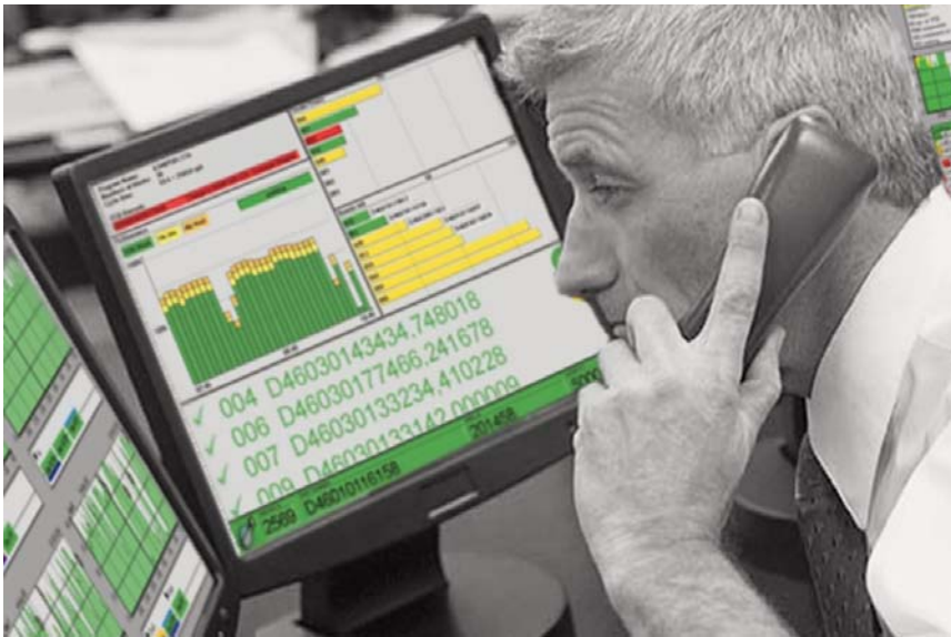
vManage presents a complete view of the manufacturing process